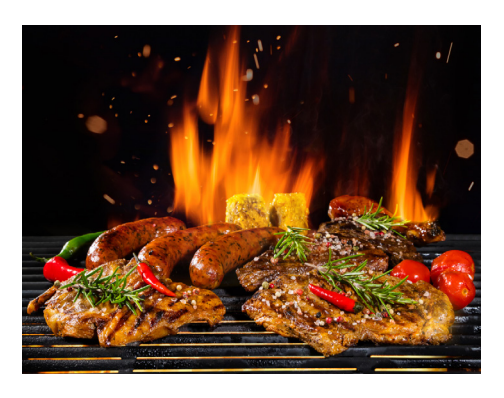
LIVE GRILL SECTION AT LATEST RECIPE