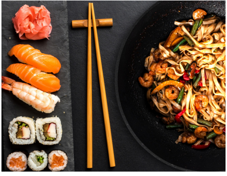
SUSHI & WOK AT LATEST RECIPE